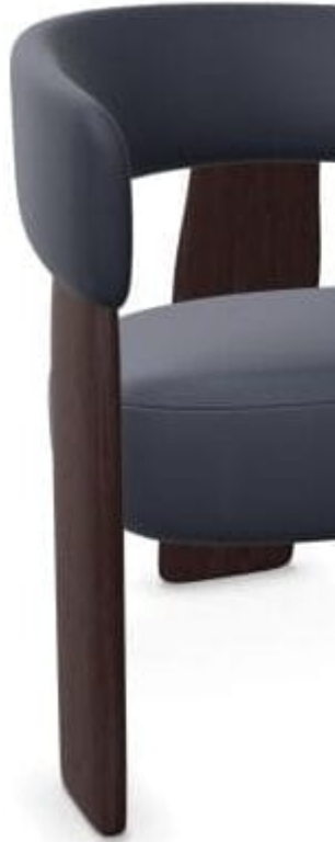
Reception Lounge and Side Chairs Andreu World Oru Chair