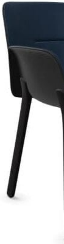
Office Guest Chair Andreu World Nuez