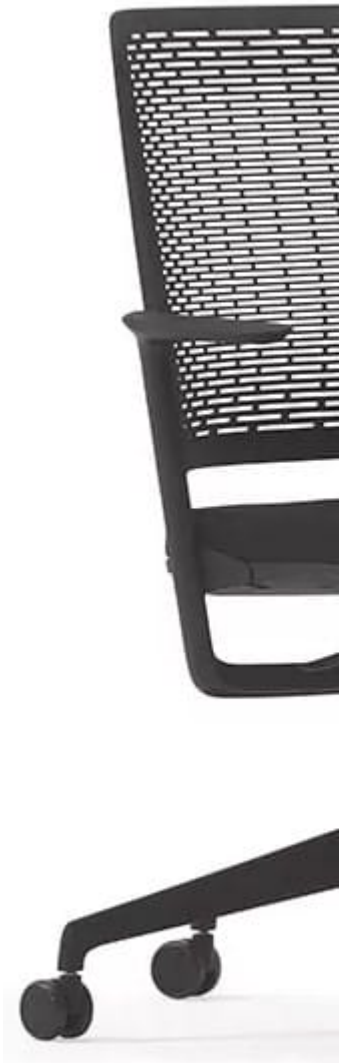
Team Room Conference Chair Keilhauer Foryu